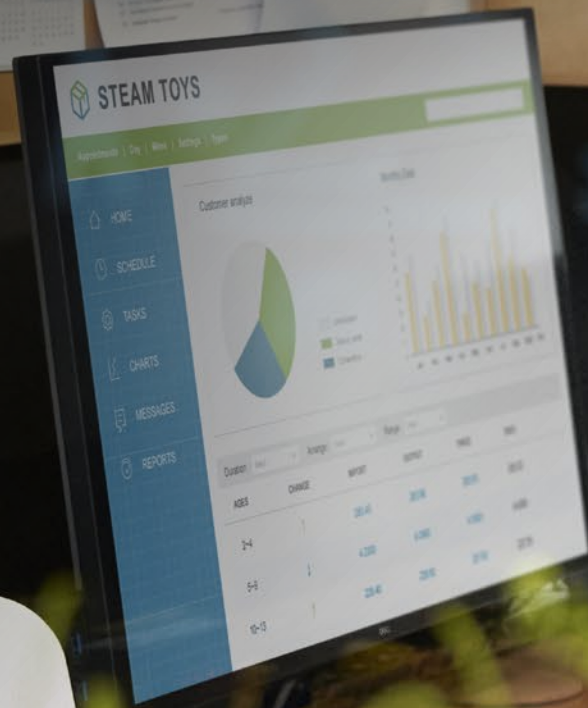
Dell PC with an 8th Gen Intel® Core™ i5 processor

Combine hardware, software, lifecycle services and financing into one all-encompassing solution with Dell PC as a Service (PCaaS).** IT challenges become a breeze with more than 60,000 Dell EMC service professionals in over 165 countries. With PCaaS, support and expertise are always within reach.