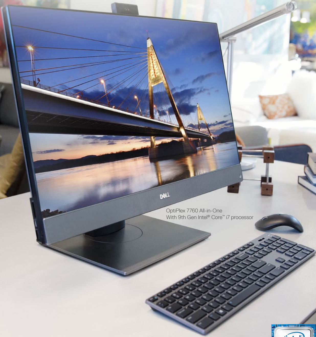
OptiPlex 7760 All-in-One With 9th Gen Intel® Core™ i7 processor

Teaming up with Dell provides you with the most secure PCs and Data Protection solutions.*