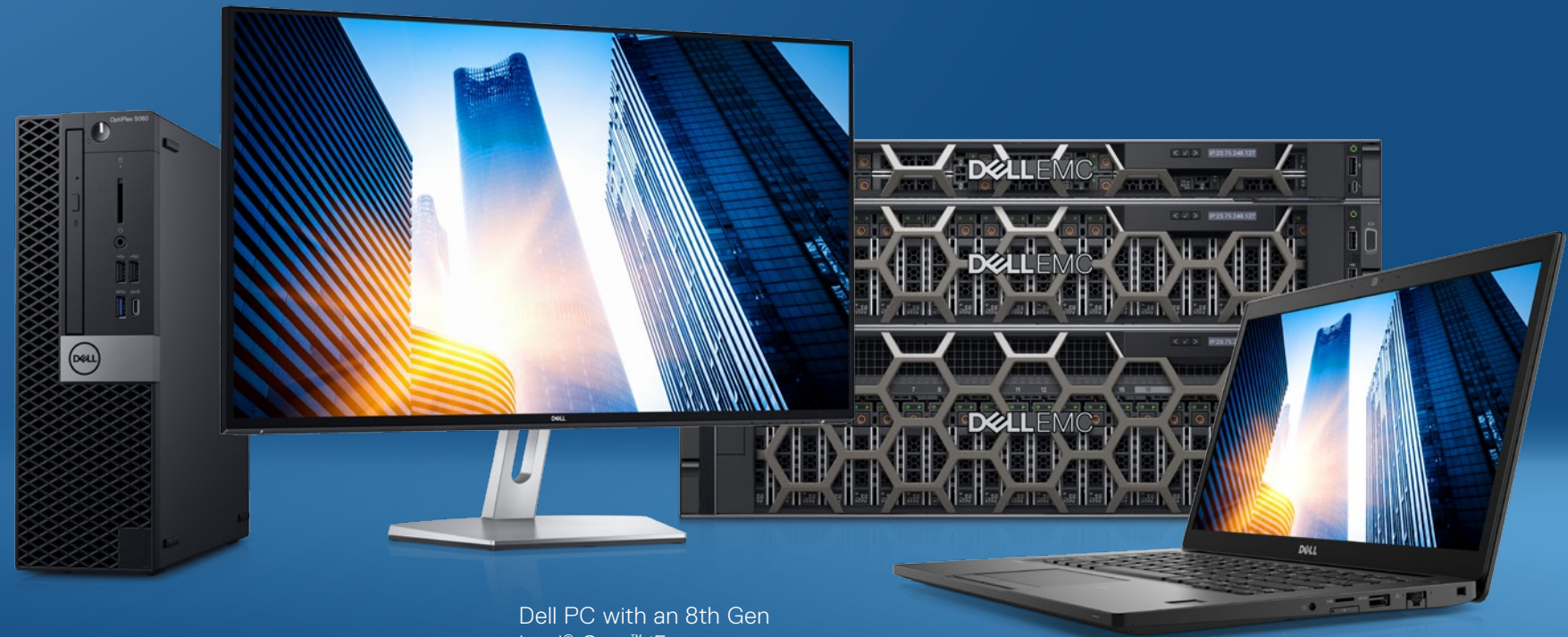
Dell PC with an 8th Gen Intel® Core™ i5 processor

Financing works with your technology strategy to build a solution that is right for the present and the future.