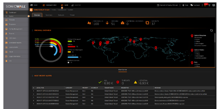
Figure 1.0 Executive Dashboard

Analytics comes with a broad range of pre-defined reports and the flexibility to create custom reports specific to your desire use or intent using any combination of traffic data and have them delivered on a regular schedule. It presents up to a year of historical records for traffic analysis and security gaps and anomalies discovery to help you track, measure, and run a security-first network and security operation center.